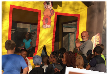
CHF kids enjoying our Summer Kick Off Party. Special thanks to Ralston Hills Church for donating the inflatable fun house & slide.

IN 2016 WE HAD A $42,096 DEFICIT ❖ WHILE INCREASING SERVICES IN 2017 WE HAD A $58,403 SURPLUS